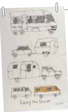
Living the Dream