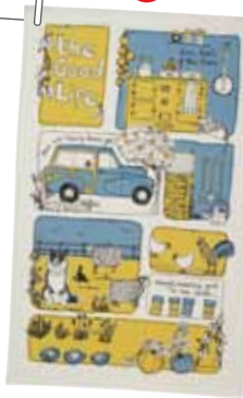
The Good Life