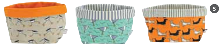
1. Cushion cover £17.99 2. Coffee cosy £48 3. Tea cosy £48 4. Embroidered storage pot £17.50 5. Printed storage pot £16 6. Prints £12.50